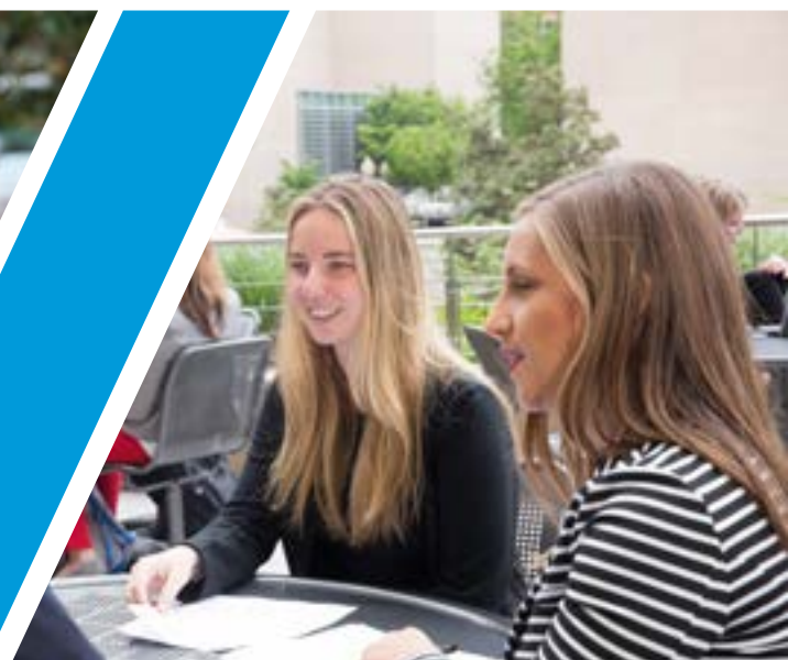
Graduate students discussing coursework on the outside terrace of Gelman Library.