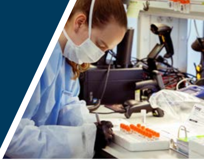
Because of its long track record in conducting vaccine research and leading clinical vaccine trials, GW investigators have developed or tested potential vaccines for COVID-19, HIV and malaria, among other diseases.