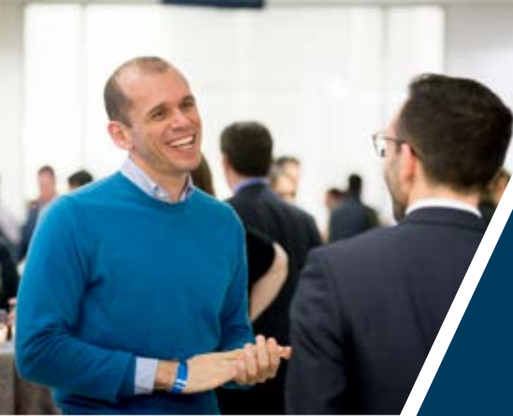
GW hosts multiple events and programs throughout the year, many for its graduate students.