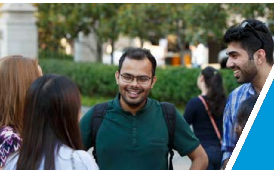
In the fall, GW hosts a graduate student welcome fair for students to get to know each other and learn about campus resources.