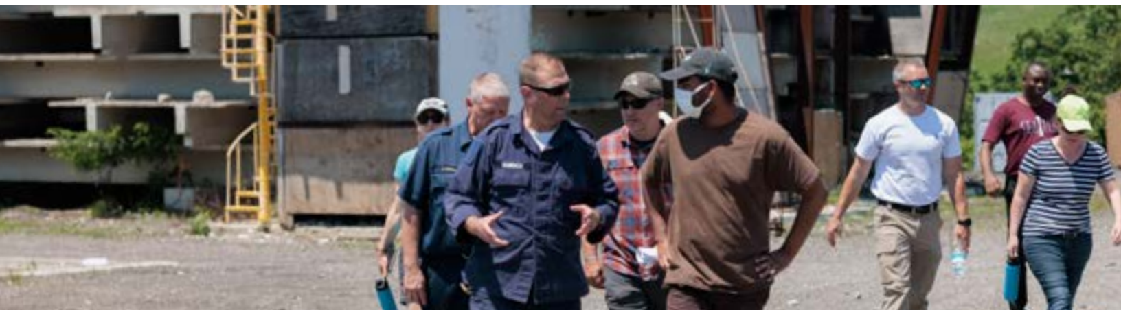
Ph.D. fellows gaining firsthand, on-site knowledge about convergent problems in artificial intelligence and machine learning.